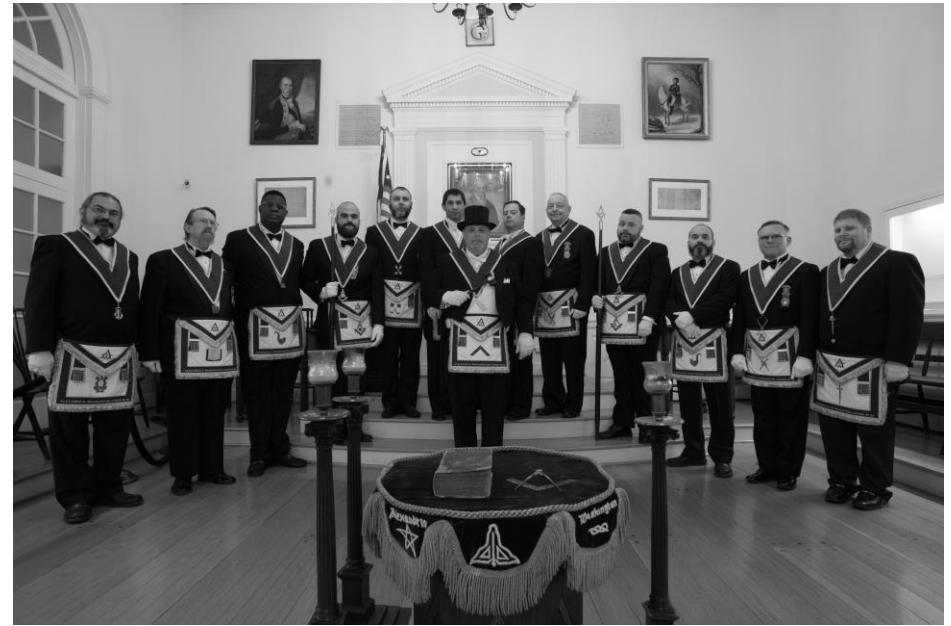
2018 Officers of Alexandria-Washington Lodge No. 22

If you have a computer and email capability but you receive this bulletin by USPS *please* take a moment and email our secretary at jackcanard@gmail.com with your name and email address. This saves your lodge time and money resulting in faster communications to you. Thank you!