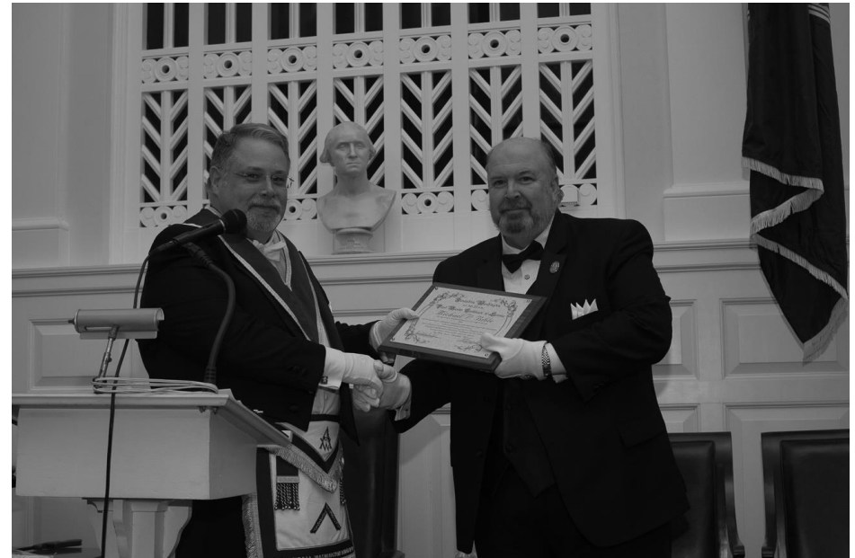
Presenting the out-going Worshipful Master with a Certificate of Service Award