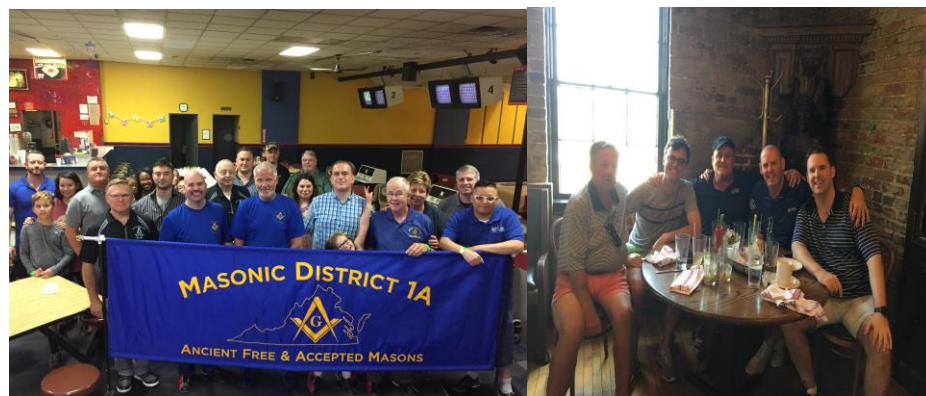
“Bowling for MAHOVA” District 1A event