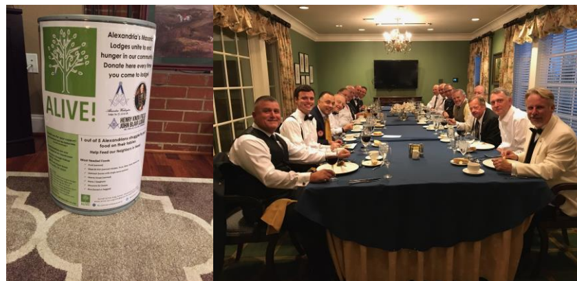
Collection bin for can goods. Awesome dinner and evening at the Army Navy Club